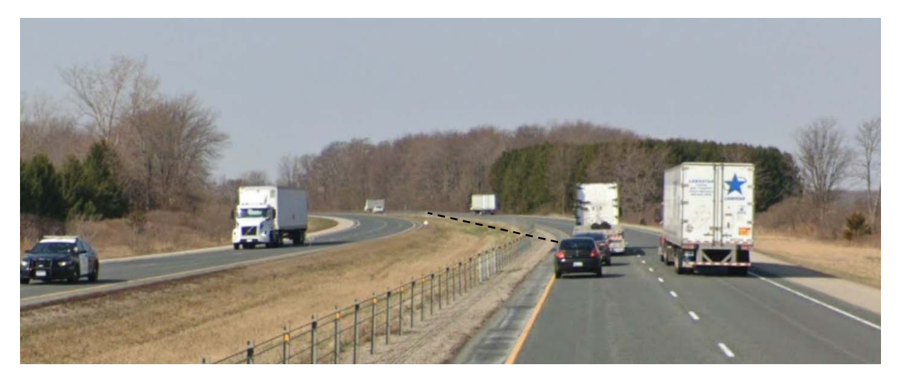
Figure 1: Effect of median barrier on sight lines around curves

Stopping sight distances and sight lines should be considered in design. Barrier system posts may affect sight lines around curves. Figure 1 shows the effect of high tension cable guide rail with respect to sight lines on Highway 401 west of London. The Highway Design Office should be consulted if there are concerns with respect to sight lines as simply increasing the shoulder width may introduce other issues.